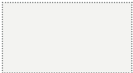
Arctic White RAL: 9016

A selection of steel locker stand colours, for use with the dry area steel lockers.