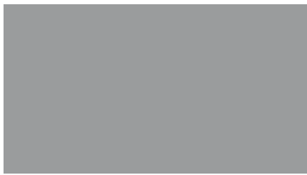
Pearl Silver RAL: 9006