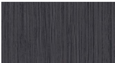
Dark Wood B101