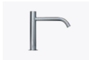
Sensor Deck Mounted Tap / Large TSL.960