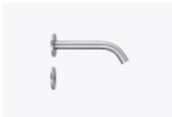
150mm IR Sensor Tap TSL.884