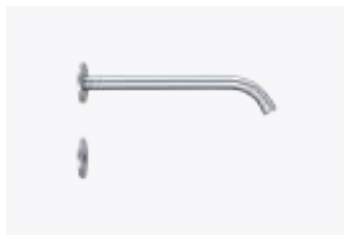
IR Sensor Tap TSL.882