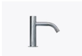
Sensor Deck Mounted Tap / Small TSL.990