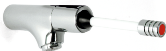
multi directional wall mounted tap (single) NC190CP

Available in standard and contemporary styles the push tap is safe, reliable and reflects the quality of the intatec range of total washroom solutions.