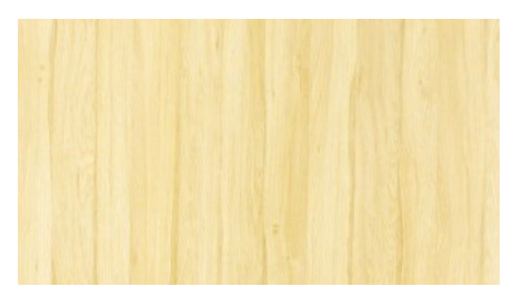
Primeval Oak LRV: 40.95