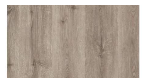
Rovere Bardolino LRV: 31.70