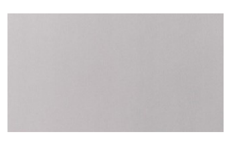
Meta Silver (Pearlescent) RAL: 9022 LRV: 38.98