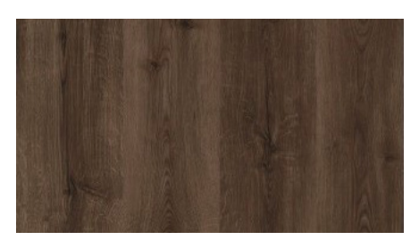
Rovere Casto LRV: 25.75