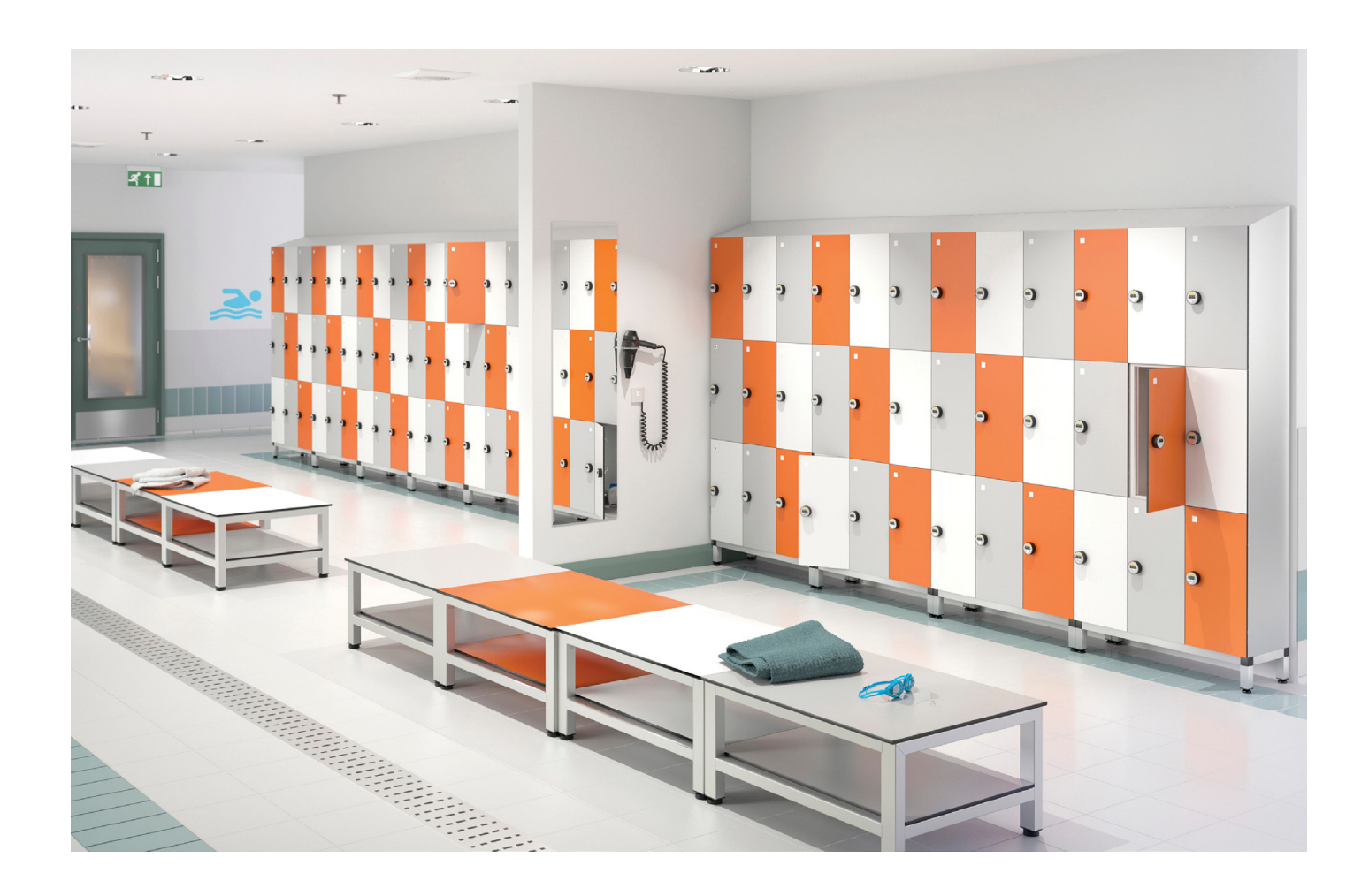
Arctic White RAL: 9016

Further details can be found at: commercialwashroomsltd.co.uk