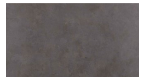
Alu Taint LRV: 28.64