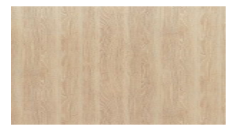
Refresh Oak RAL: 9005 LRV: 5.34

Further details can be found at: commercialwashroomsltd.co.uk