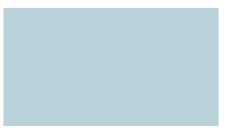
Sky Grey RAL: 6034 LRV: 54.64